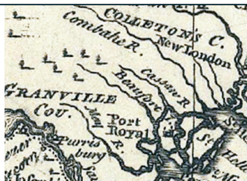
Development of Port Royal area, mid-18th century Bowen 1752