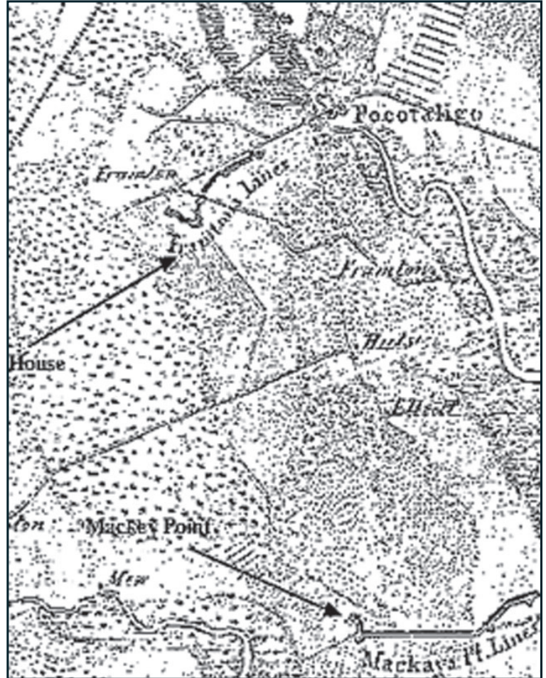
Map of Rebel Lines during Civil War O.M. Poe (National Archives RG77 in Schmidt 1993:xxxiii)

Charles Fraser, the visionary developer of Sea Pines Plantation on Hilton Head Island, bought land at Point South in the mid- to late-1960s in anticipation of Interstate 95 that was built through the area between 1965 and 1980. Fraser's plan for a unique commercial development at Point South recognized the area's unique location as a crossroads of the Lowcountry, at the intersection of Interstate 95 and Highway 17.